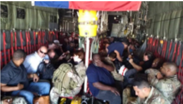
View of the inside of a C-130 filled with #PrimePower NCOs from A/249 and B/249 along with civilian responders. The aircraft arrived in Puerto Rico to provide additional support to hurricane #Maria recovery efforts.