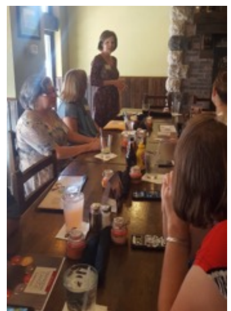
AESC Castle Gram