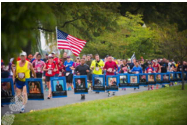
AESC Castle Gram