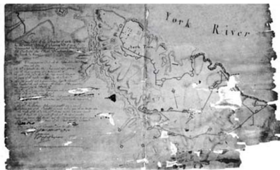
British defenses and the American and French siege works at Yorktown as documented by Col. Gouvion, Corps of Engineers, ten days after the surrender, October 29, 1781.