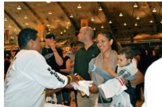
Volunteers in action