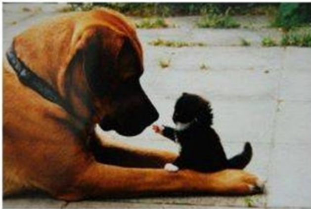
Okay, Ralph .... let me 'splain it you again. You're big, I'm little; BUT!!! you're dog, I'm cat ..... that makes me the boss. Got it ??

THANKS TO ALL WHO PARTICIPATED IN THE BOOK DRIVE—THE CHILDREN REALLY APPRECIATE IT!!