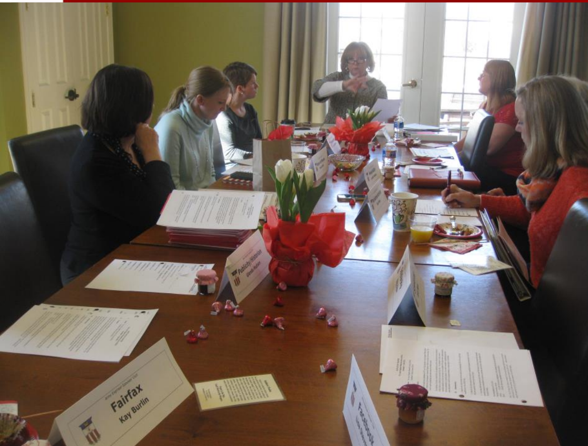
Above: Members of the board at February's meeting