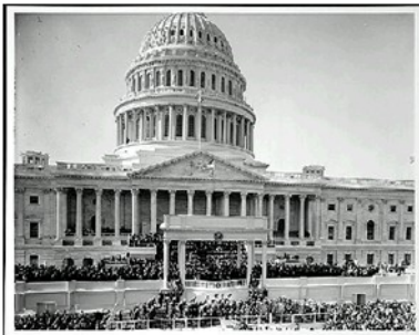
Inauguration of President Kennedy on east portico of U.S. Capitol, 20 January 1961