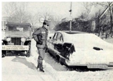
An Engineer soldier from the Inaugural Snow Removal Force sizes up the job of moving one of many D.C. cars abandoned after the surprise pre-inaugural snowfall

"Keeping our worldwide Engineer family connected - through the years and across the miles."