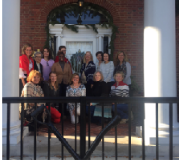
Above are a few pictures from the December Board Meeting and Cookie Exchange. Check out that beautiful wreath! You still have time to order yours!