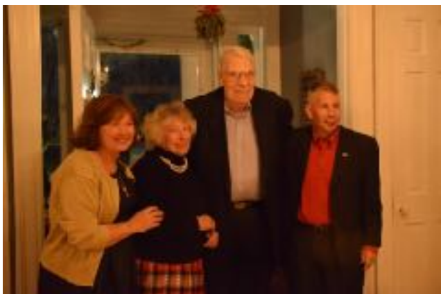
The Noahs & The Semonites