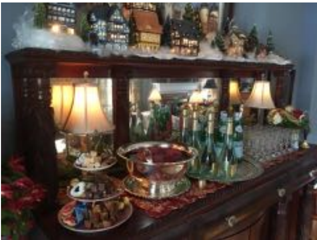
The Hains sideboard