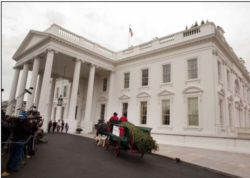
Arrival of the official White House Christmas tree at the North Portico of the White House, Nov. 26, 2010.

December's program will still be a tour of the White House though the date and time are still to be determined. The RSVP list is closed and all the spots are filled. More information will be sent to those on the RSVP list as soon as we are notified. Thanks to everyone for being so flexible.