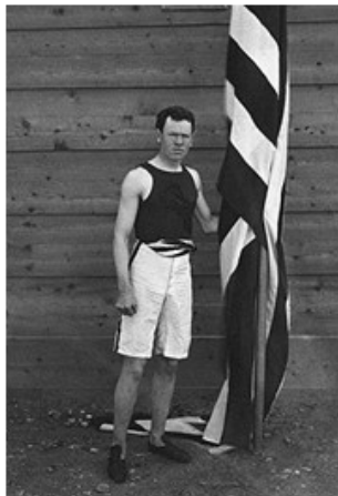
First-place medalist James Connolly, Athens, 1896

Some fifty years later, Harvard awarded Connolly a Harvard sports letter, perhaps a belated apology for not encouraging him to return to finish his education. By that time, he was a well-known author (even having lectured on literature at Harvard), war correspondent, novelist, and short-story writer. But his own autobiography testifies to those halcyon and no doubt formative years that he spent as a young man in Savannah.