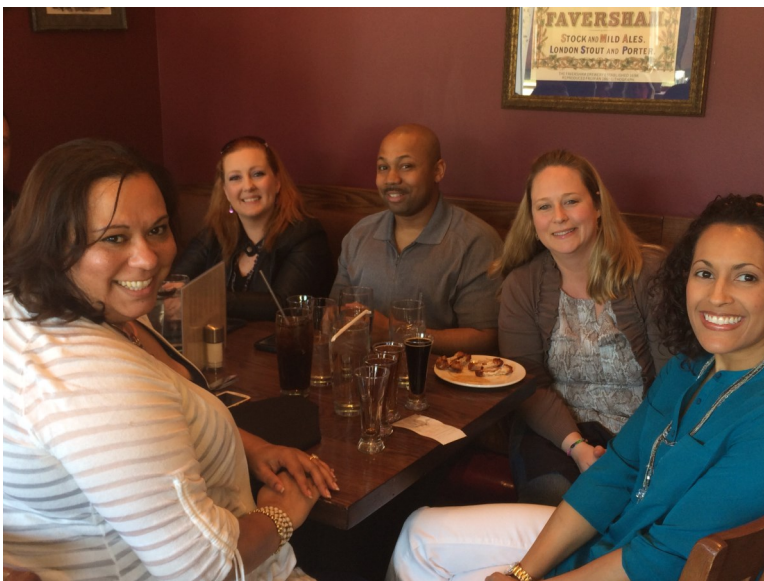
Above: March 15 Beer Tasting Event at Mad Fox Brewing Company Below: March 19 bake sale at Knollwood See inside for more photos!