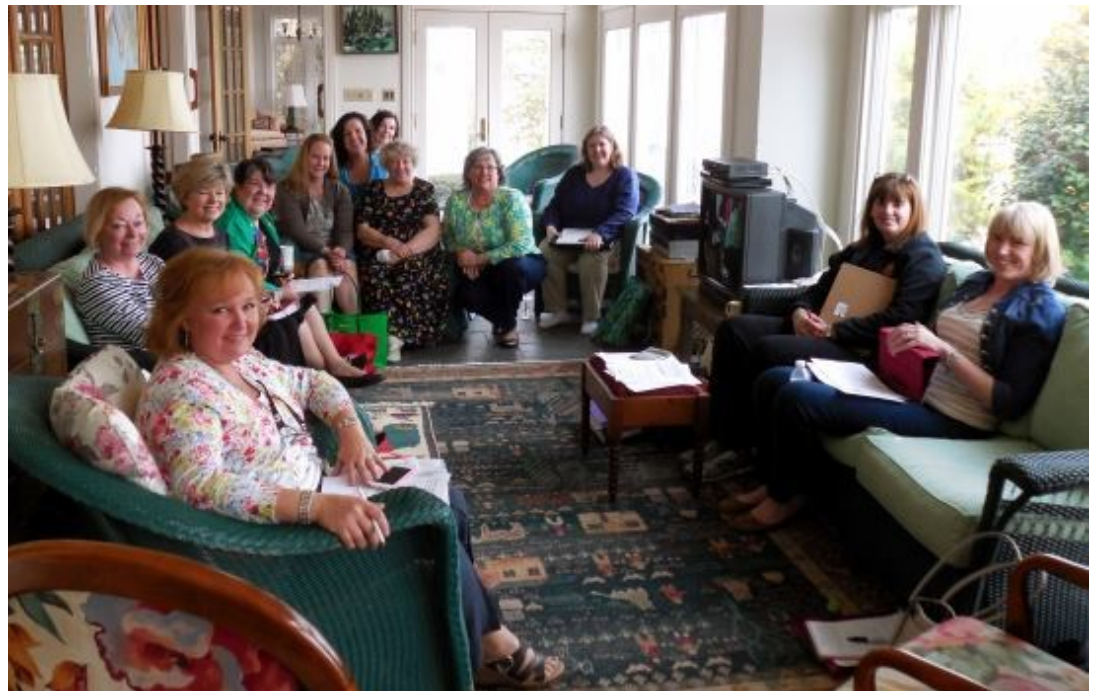
APRIL 2, 2014 AESC BOARD MEETING