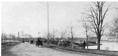
Horse-drawn carriages carry passengers along the new drive at the Tidal Basin, early 1900s

The Corps' work in Washington demonstrates what engineering can achieve to provide improved recreation and beauty for crowded city dwellers and visiting tourists from around the world.