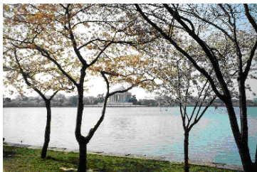
Cherry trees in bloom along the Tidal Basin in Washington, D.C.

"Keeping our worldwide Engineer family connected - through the years and across the miles."